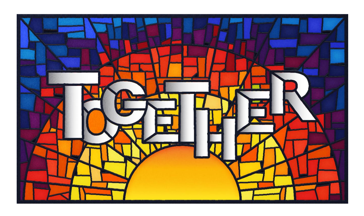
Feeding the Hungry + Welcoming the Stranger Being Transformed by God