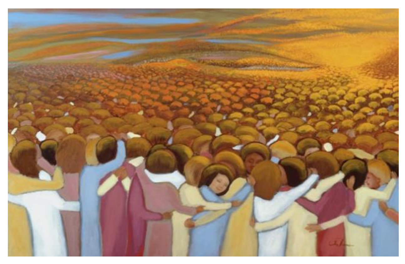
"The Communion of Saints"

Feeding the Hungry + Welcoming the Stranger + Being Transformed by God